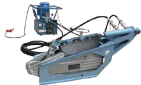
TU 32 H