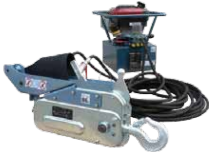
TU 16 H

The Tractel TUH Series Hydraulic Tirfor® machines are portable motorised hoists used with maxiflex wire rope.