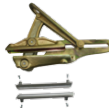
Obtain liner set with screws.