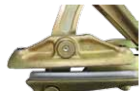
Tighten both screws on top and bottom jaw.