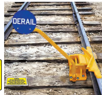
Sleeper-Mounted Sign Plate

At a distance, you can't see a derail unless the derail sign is raised. Remind your workers of the importance of lifting or lowering the sign plate when using a derail