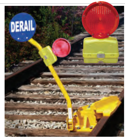
Flashing Red Light