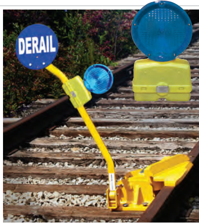
Flashing Blue Light