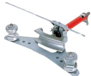
MODEL NO. PB-15N