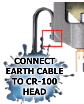
Model No. CR-100EK

Refer page 54-55 for battery & charger details