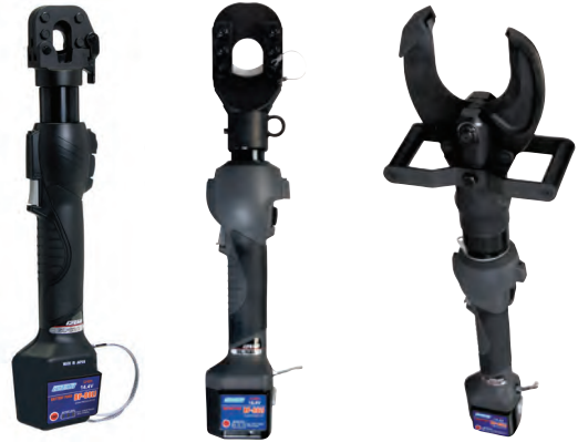
SLS-20 SL-S40 SL-95YC