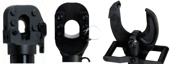
Latching Guillotine Head Pin Style Guillotine Head Scissor Head