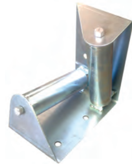
TCR78-300 For Larger Cables