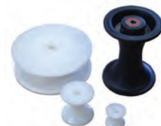
VARIOUS NYLON/PLASTIC ROLLERS