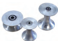
VARIOUS ALUMINIUM ROLLERS INCLUDING BEARINGS