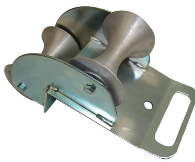
TRGM-100-2 Twin Roller