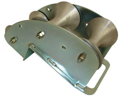
TRGM100-3 Triple Roller