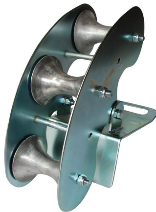
PMRG Series Pivoting Roller Guide