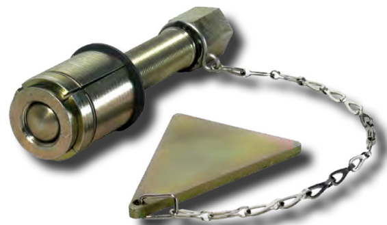
Indispensable for separation of piping for DIN, ANSI (ASA) and B. Std. Flanges