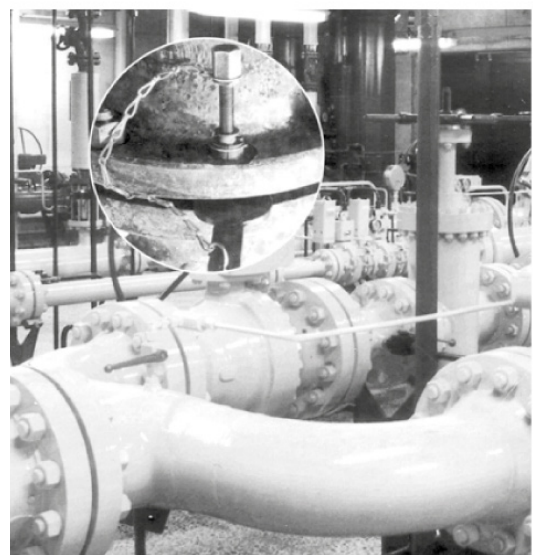
DBP Nr. 2522817 • US Patent No. 4015324