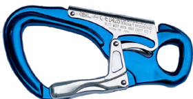
K058.07151.BK Double Action Hook