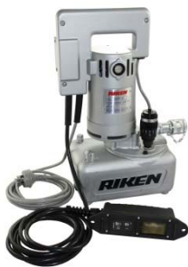
Riken 700 Bar Electric Pump Model No. SMP-30AR-329C