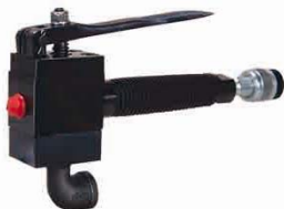
Riken 3 Way Deadman Valve Model No. HV-1