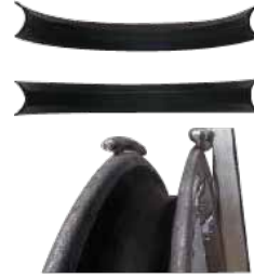
Replaceable Nylon Sectors