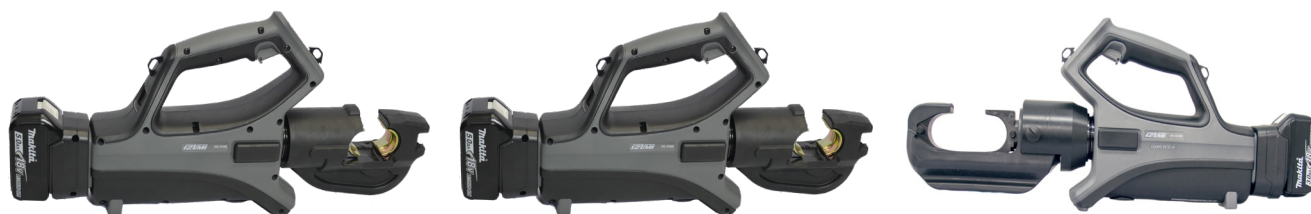
S7L-431M Lunchbox "C" Head