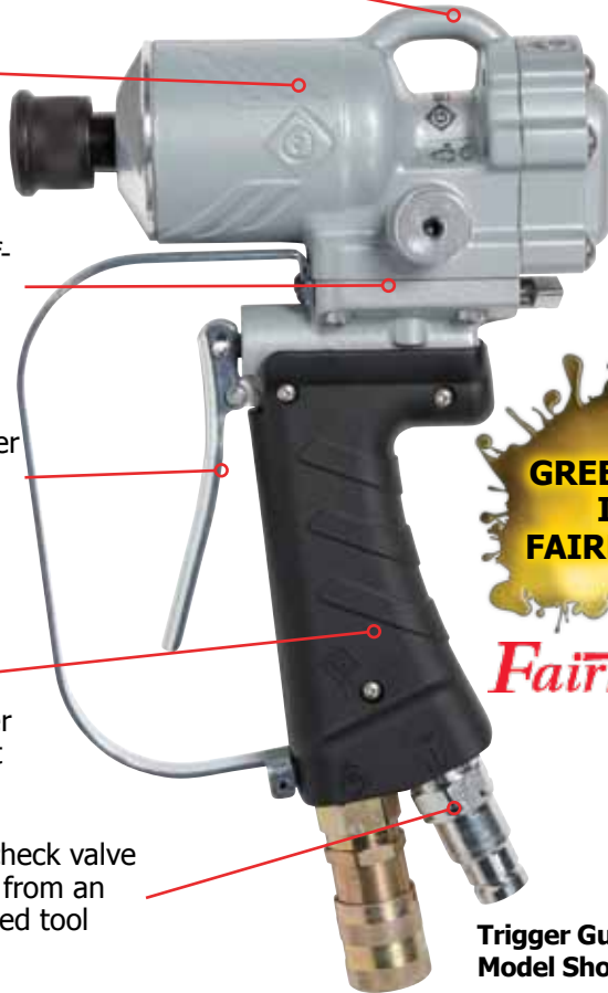
Trigger Guard Model Shown