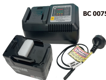
BC 0075G (230V) Charger