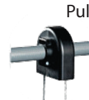
Pulley Protection Cover