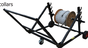
CDT-500 Folds Down for Storage & Transport

Optional winding handle model available with drum fixing arm