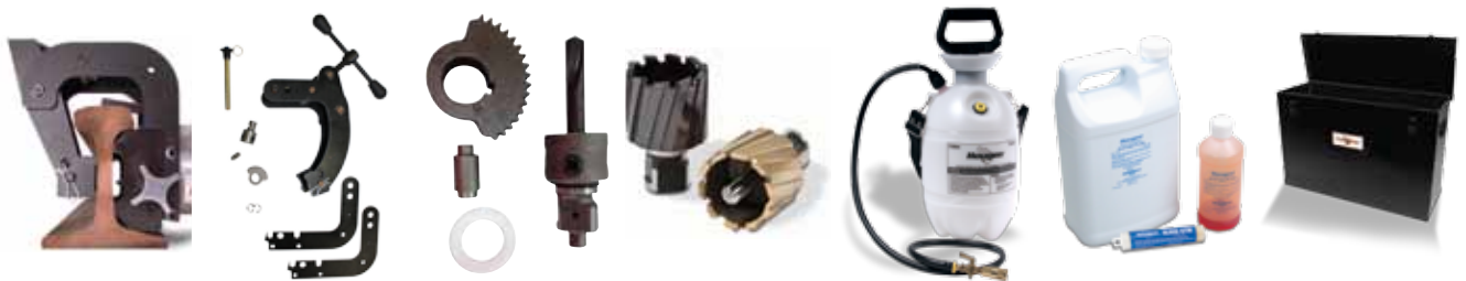
Rail Shoes Retrofit Kits Bonding Twister Bits Coolant Bottle Coolant & Lube Storage Case