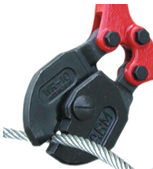
'WR' Cutting Head shown with notched blade