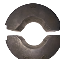
12T-UO & 12T-DU1315