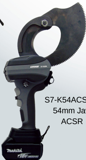
S7-K54ACSRM 54mm Jaw ACSR