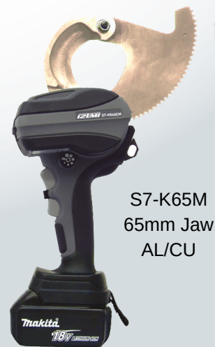
S7-K65M 65mm Jaw AL/CU