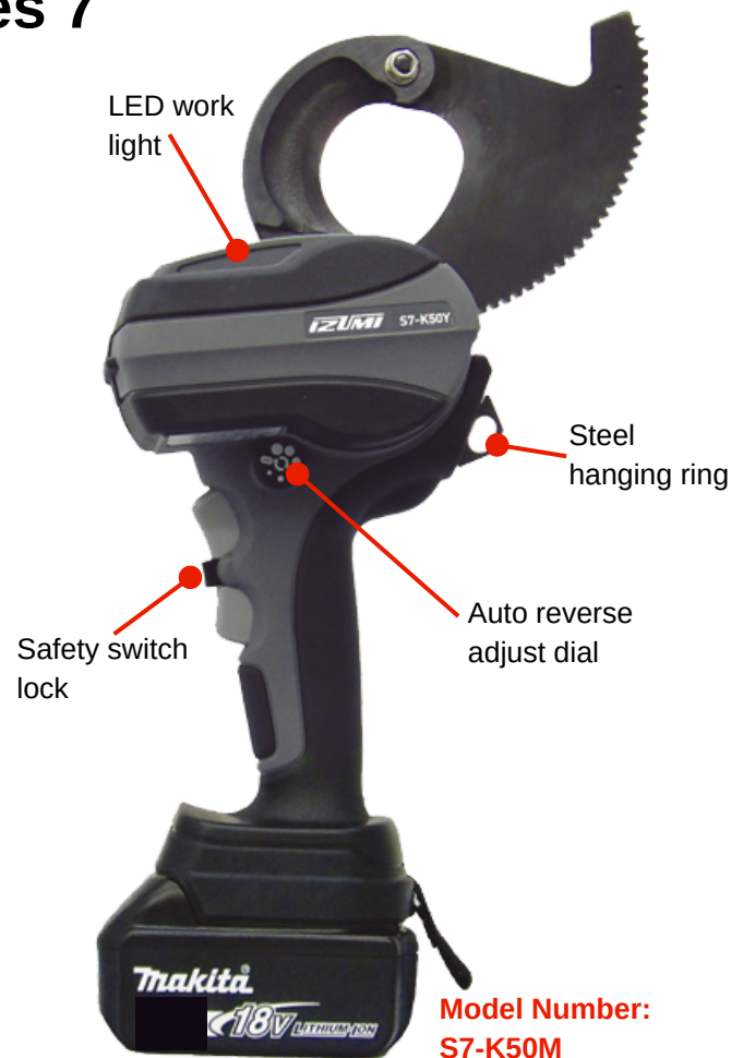
Model Number: S7-K50M