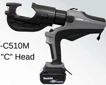
S7G-C510M Pistol "C" Head