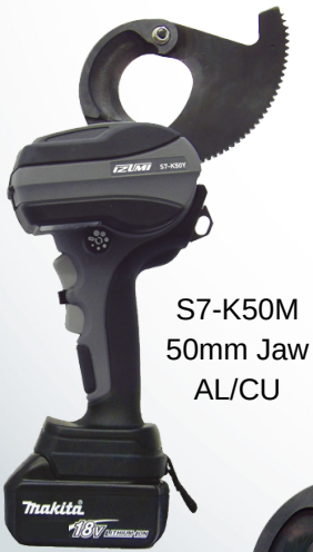
S7-K50M 50mm Jaw AL/CU