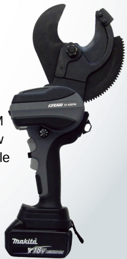
S7-K50YM 50mm Jaw Scissor Style AL/CU