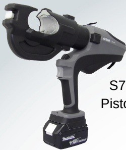
S7G-C431M Pistol "C" Head