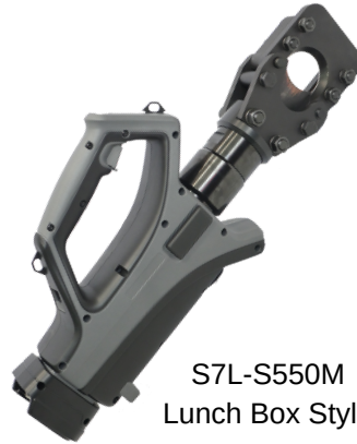
S7L-S550M Lunch Box Style