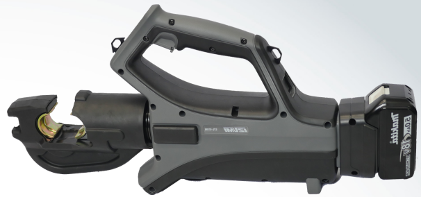
S7L-431M Lunch Box Style