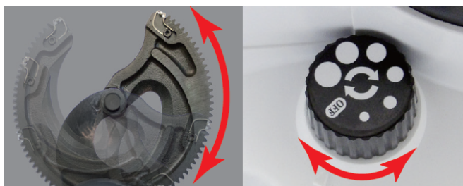
New auto reverse feature for continuous cutting