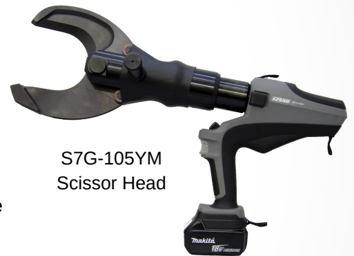
S7G-105YM Scissor Head