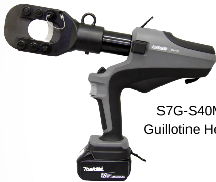
S7G-S40M Guillotine Head