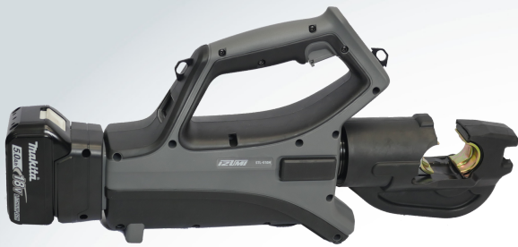
S7L-510M Lunch Box Style