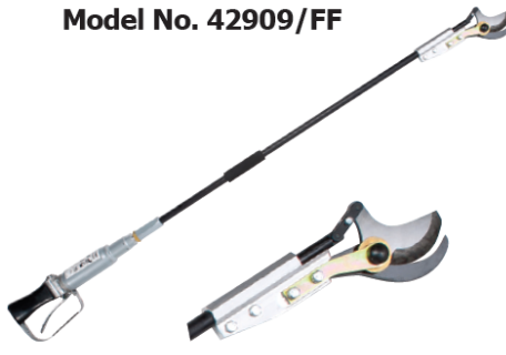
Orchard and Shade Tree Pruner